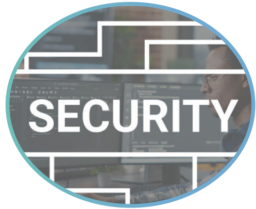
Security team is updated when an alarm is triggered